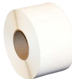
400-600 TT NP

All Trademarks are the property of their respective owners. All model designations are for compatibility purposes only.